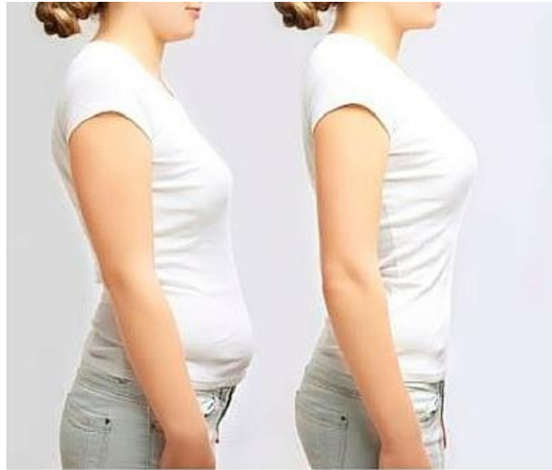
Distorted Posture Correct Posture

Posture is of great importance to our well-being and is often the first indication of stress. Very few people have ideal posture and in consequence many have either physical problems or may experience varying degrees of pain and discomfort.